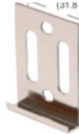
Vancouver Mirror Slide